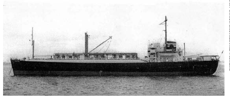
m.v. Methane Pioneer

The LNG ship plays a major role in the development of this industry and the carriage of the substance in bulk is of prime importance. The difficulties in ship design were that steel cannot withstand the -162C temp. of LNG