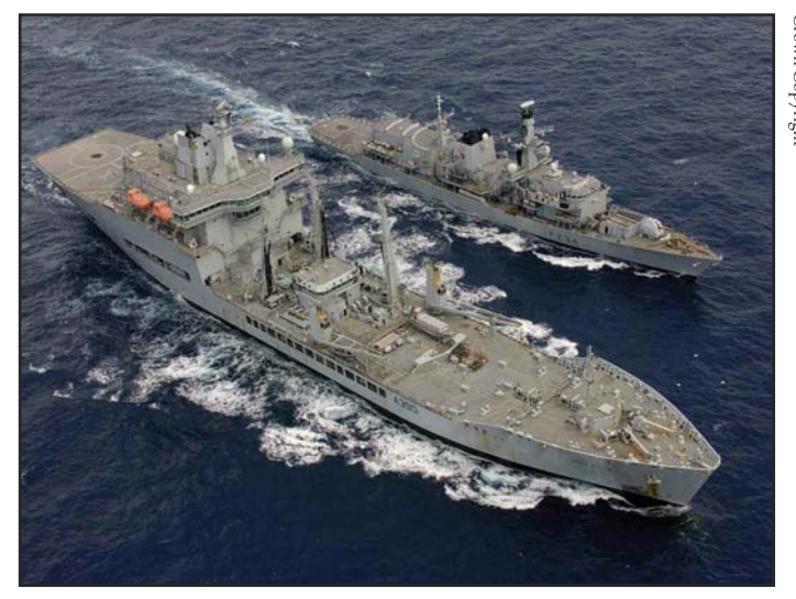
HMS Iron Duke gets set to refuel from RFA Wave Ruler

ROYAL NAVY and Royal Fleet Auxiliary (RFA) sailors will be getting their hands on a new bespoke training facility to teach them how to safely transfer vital supplies from ship to ship while at sea. The MOD has signed a £25 million contract with Rolls-Royce Power Engineering based in Bristol to develop a new range of replenishment-atsea (RAS) equipment. RAS is a method of transferring