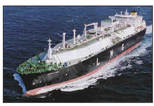
s.s. Granatina - a membrane type LNG ship

The main advances since the Methane Princess which carried 27,400 cu.m. of LNG are that maximum sized vessels now in service will carry 260,000 cu.m. Designs are in place for even larger vessels. Whilst the design of the containment systems in LNG ships restricted re-liquefaction, there is inevitable 'boil-off', which is used for firing the ship's boiler creating steam for the ship's main turbine engine. In recent times however, an element of re-liquefaction takes place, ensuring that 'boil off' can now be retained as cargo. A further development within LNG shipping is the replacement of steam turbine engines with the more economical dual fuel diesel engines using 'boil off' as supplement fuel on cargo loaded passage.