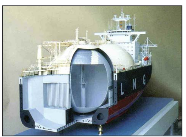
A model of the Moss Rosenburg LNG System

Currently the largest natural gas fields in the world are in the Soviet Union, Canada, U.S.A. and Qatar, the latter being currently in operation and expanding rapidly. The Soviet Union fields are in difficult climate and terrain. Other major natural gas exporters include Algeria, Indonesia, Brunei, Nigeria, Malaysia and Australia; the last two rising fast with new finds and developments. The largest importers are Japan and South Korea with China and India as major development markets. Turkey, Spain and Taiwan are all rising with France being steady. The U.K. and U.S.A. are also increasing the import of LNG notwithstanding their internal production. The LNG trade overall has been continually rising since it all began and it is anticipated that it will become the world's prime fuel resource within the next 20 years. A prime advantage is that it contains less than 2% carbon dioxide. All the oil majors are keenly involved in this enhancement as are the Governments of the countries where it is found. There is an obvious desire for such Governments to develop their own resources, but for the foreseeable future they will need and will acquire the professional skills from the developed nations.