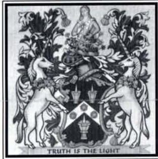
Crest of Worshipful Company of Wax Chandlers

As a permanent reminder of their original purpose the Company, in 1958, undertook to supply beeswax candles 'in perpetuity' to the new high altar in St. Paul's Cathedral. Although many members have interest in either beekeeping or the modern wax industry, membership is not restricted to these fields. Ladies have been admitted to the Livery of the Company since 1981, although the earlier records show that ladies were granted the Freedom of the Company up to 1799.