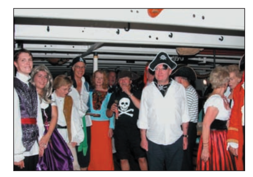
Guests at the Summer Reception took every opportunity to dress up in 'nautical' costume.