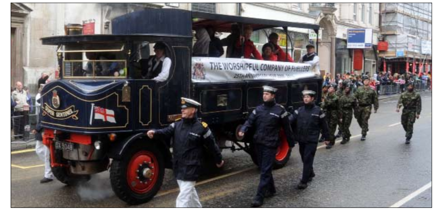
14 November 2009 - The Super Sentinel from HMS Sultan