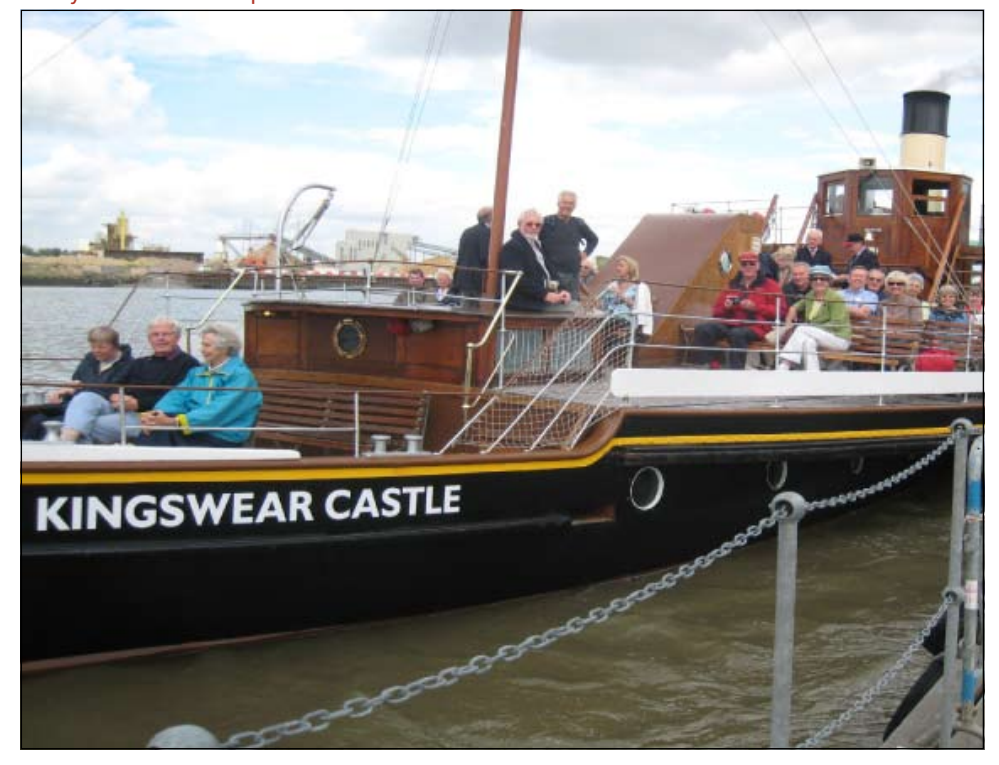
23 July 2009 - Fuellers depart for Rochester