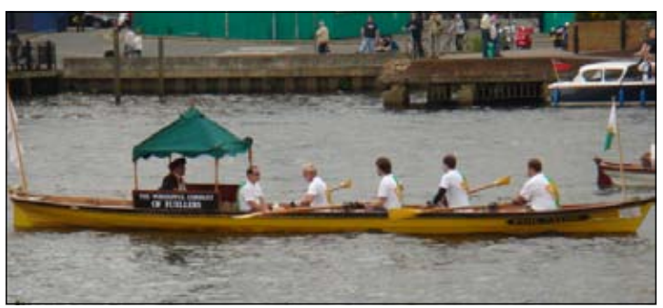
June 2009 – Fuellers' crew take it easy, Master very easy