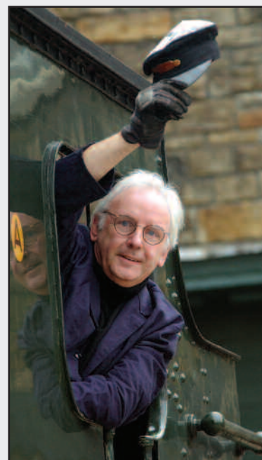
Pete Waterman OBE DL