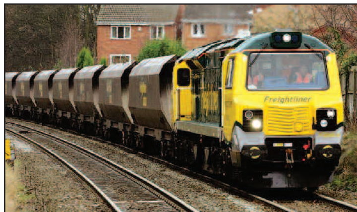
Freightliner Heavy Haul Class 70 Diesel Locomotive