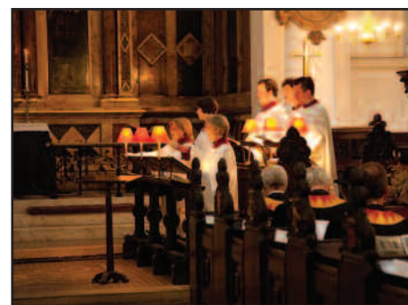
The choir in St Michael, Cornhill