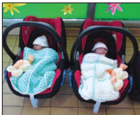
Sophia and Hermione leave hospital