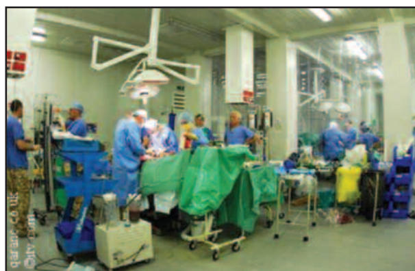
Camp Bastion Field Hospital