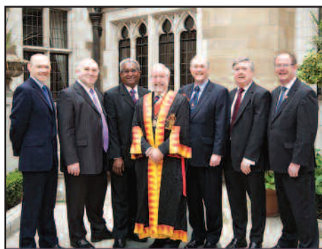
The Master with the new Freemen and Liverymen at Merchant Taylors' Hall