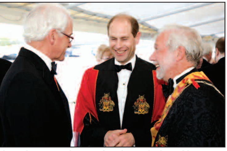
The Immediate Past Master shares an anecdote with His Royal Highness and the Master