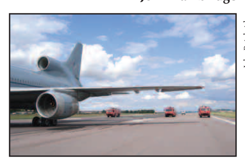
The reception committee on the return to RAF Brize Norton