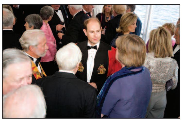
Their Royal Highnesses circulate on the quarterdeck

The Learned Clerk is to be congratulated on organizing such an absolutely splendid evening. As always seems the case on Wellington , the food and wines were first rate. Thanks also to our Beadle for another extremely professional job. (continued...)