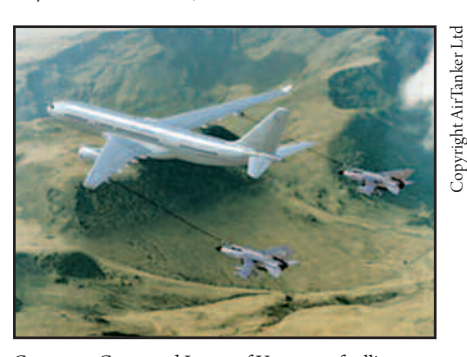
Computer Generated Image of Voyager refuelling two RAF Tornados

as well as up to three Critical Care patients. An enjoyable evening was later spent at dinner in Burford with teams from 216 Sqn and AirTanker Ltd.