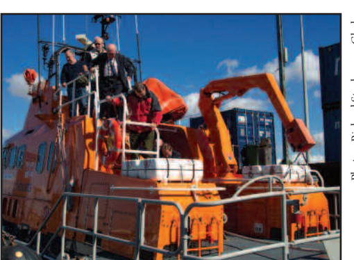
Some of the Fuellers' party inspecting RNLI Albert Brown