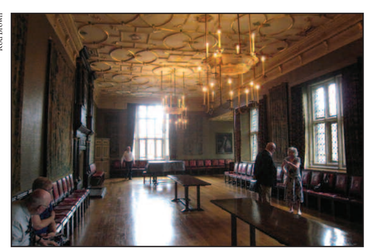
The Great Hall - the Charterhouse