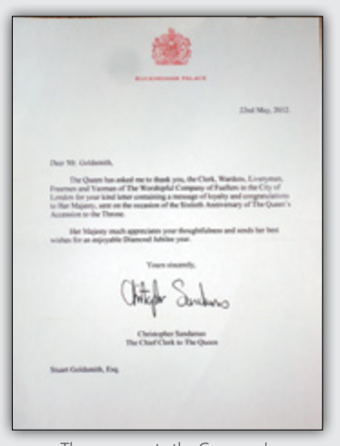
The response to the Company's Loyal Address