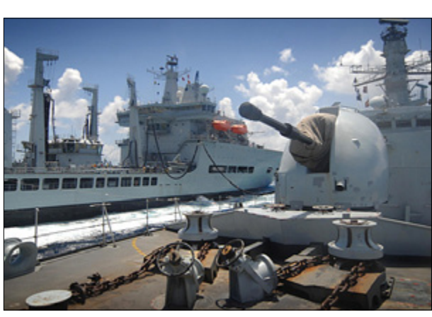
RFA Wave Ruler replenishes a Royal Navy frigate at sea