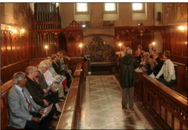
Some of the party in the Victorian chapel at Fulham Palace

We dispersed for lunch and then a larger group assembled at Westminster Pier to join MV Salient for our outing on Old Father Thames. We moved away upstream, passing under Chelsea Bridge before turning downstream. Bunting and flags fluttered along the banks of this most magnificent of rivers