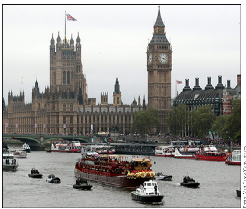
The royal barge passes crowds lining the river near the Houses of Parliament