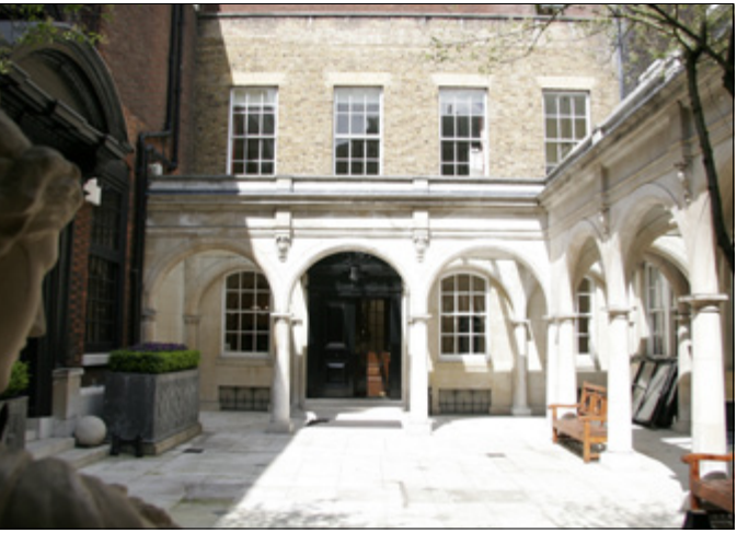
The courtvard at Skinners' Hall

The offices at number 9 will serve us very well with storage and strongroom space enabling us to have our Court garments and regalia to hand, store records and archives plus the