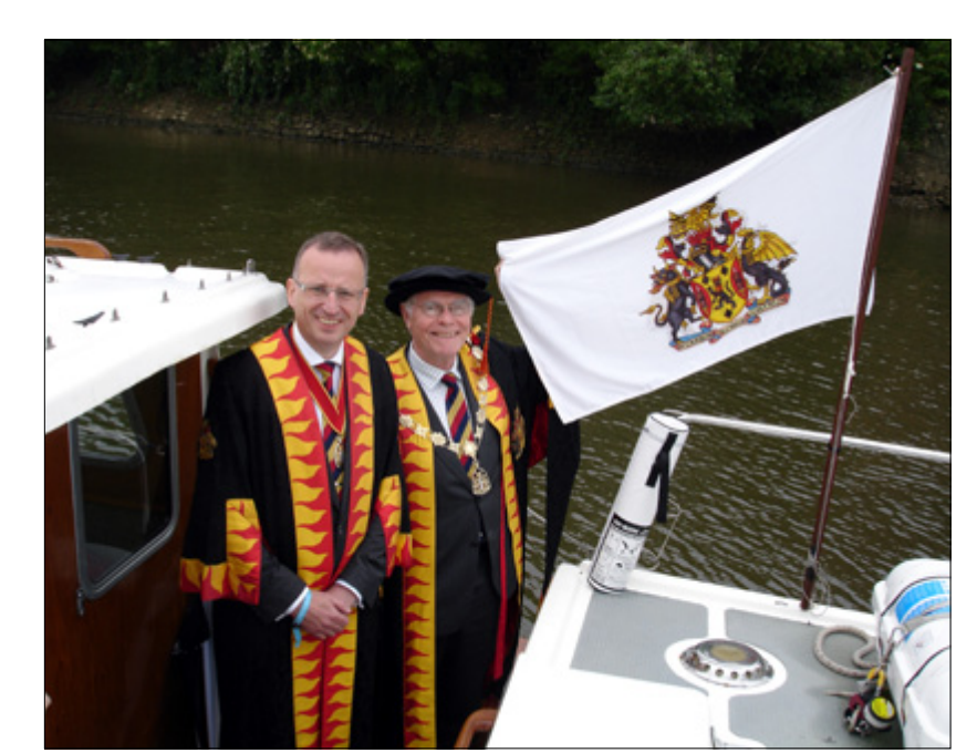
Raising the flag on Thames Fueller - the Master, right, with the Senior Warden

The exhilaration of being there is unforgettable, something we shall always remember. A pleasure which will last a life time.