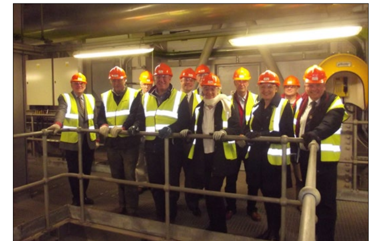
Inspecting where waste is turned to heat

This waste is extremely suitable for energy recovery