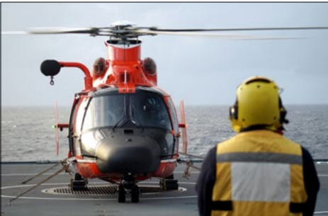
Wave Knight & US Coast Guard Helo

Wave Knight is coming to the end of a 16-month deployment to the Caribbean providing support and assurance to the UK Overseas Territories. The past six months have seen the ship concentrate on counter-narcotics operations with considerable success. Working closely with the US Coast Guard as part of a multi-national effort, over 1.5 tonnes of cocaine and 1.75 tonnes of marijuana with a combined UK wholesale value of around £80M (street value significantly more) have been seized and 18 people detained. In January, the ship became the first non-US unit to embark an armed USCG helicopter which was instrumental in forcing two of the cocaine smuggling boats to stop and submit to inspection by the USCG Law Enforcement detachment on board. The ship also completed a rare, high-profile Defence Engagement visit to Cuba during December.