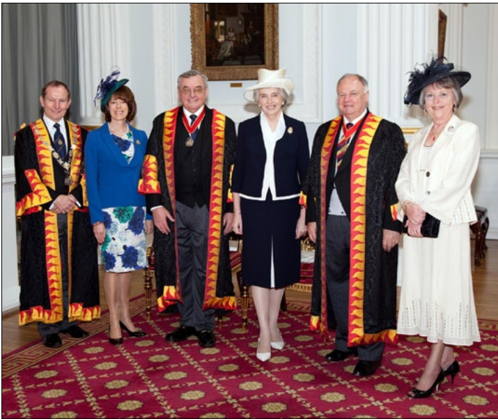
The Master, Mistress, Senior Warden and his lady and the Junior Warden and his lady