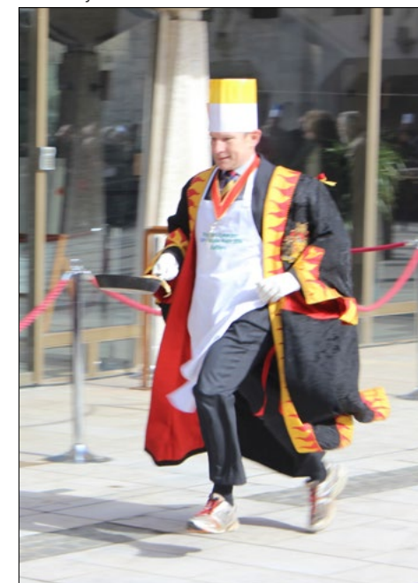
The Master was in fine form and did not "pancake" at Guildhall

his most convenient and spacious apartment.