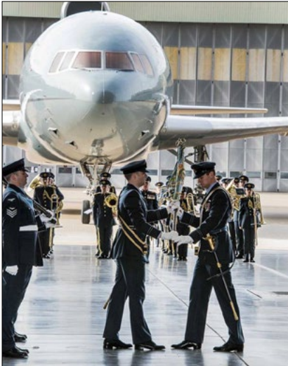
216 Sqn standing down parade

The disbandment parade of 216 Squadron took place on 30th March at RAF Brize Norton. The parade, attended by the Chief of the Air Staff, Air Chief Marshal Sir Andrew Pulford, also saw the retirement after 30 years of distinguished service of the TriStar aircraft. The Master and Clerk represented the Company at the parade. The disbandment brings to an end a notable 96 year history of 216 Squadron, which for the last ten years has been a vital part of the air transport "Airbridge" to Afghanistan, and transport & air-to-air refuelling aircraft to the Falkland Islands. The Tristar is replaced by the RAF's new Voyager fleet operated currently by Squadrons 10 & 101. Voyager will guarantee the RAF's Strategic Air Mobility into the future