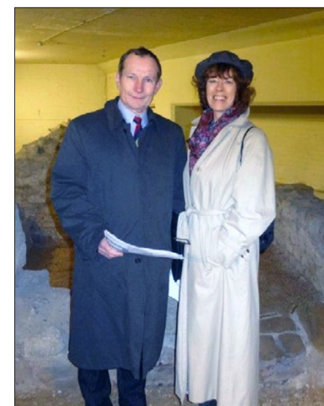
The Master and Mistress beside Roman foundations of the City Fort Gate

On to March, when we combined entering the hilarious City Pancake races with a tour of St Paul's Cathedral. What fascinating places are behind the scenes there. Then back to The Old Bailey where we sat in the dock and enjoyed a theatrical evening. Our visit to Grundon's Energy from Waste Plant was fully subscribed and proved to be very educational.