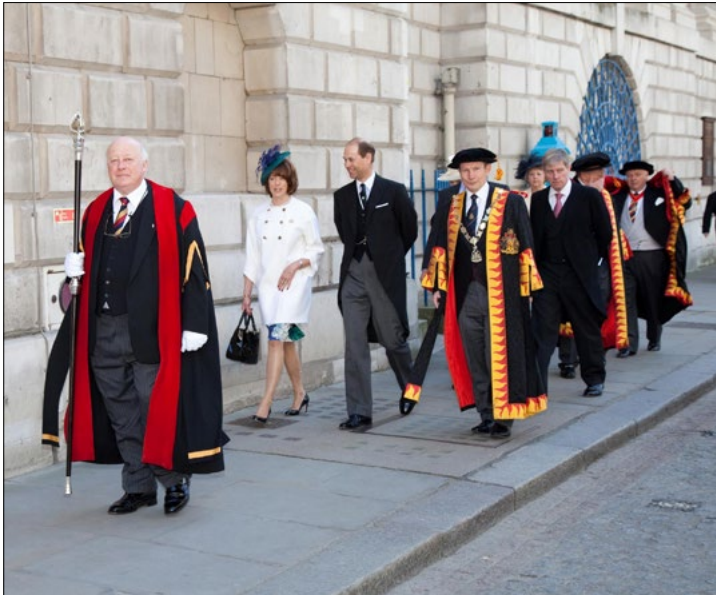
Processing to the Mansion House