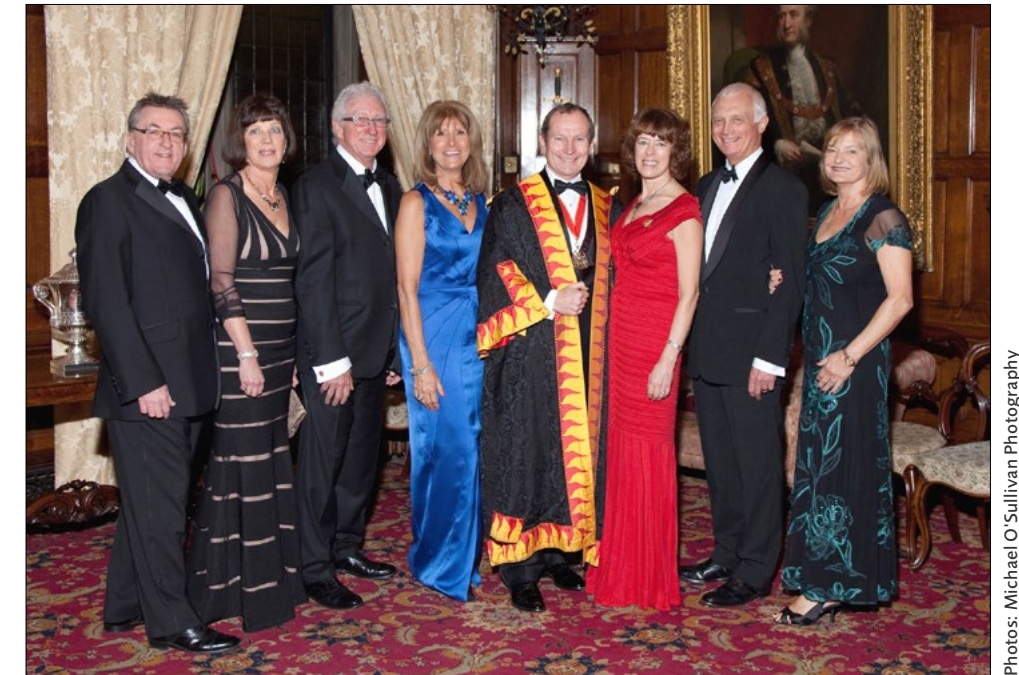
The Master and Mistress with their guests