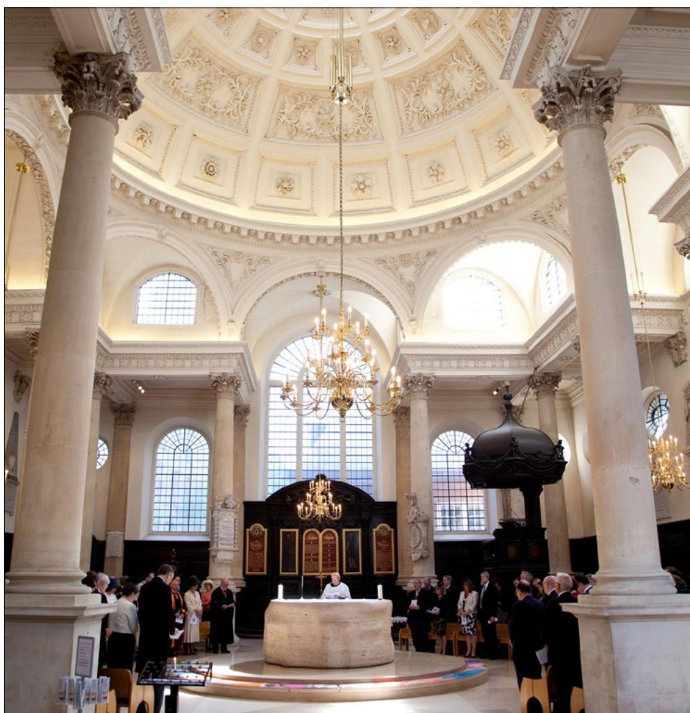
The service at St Stephen Walbrook

In welcoming the Principal Guests, who included five Masters of other