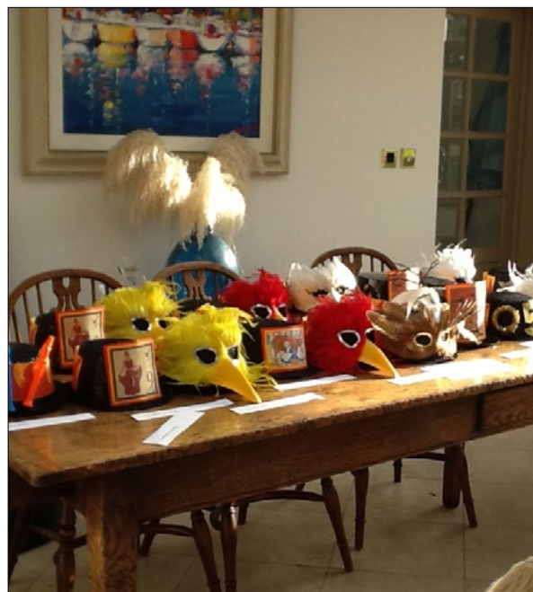
Fancy Hats ready for the Christmas lunch at Butchers' Hall

already. This comes as no surprise as I seem to be working on, or going to, something related to the Fuellers nearly every day of the week. Here are a few highlights.