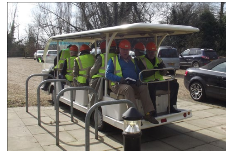
Fuellers being chauffeured by the facility’s owner