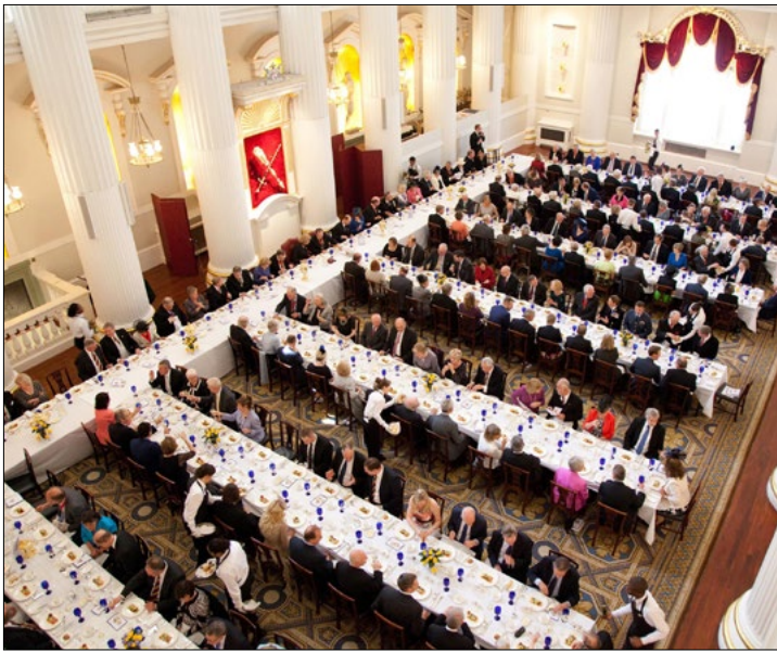
The luncheon in the Egyptian Hall