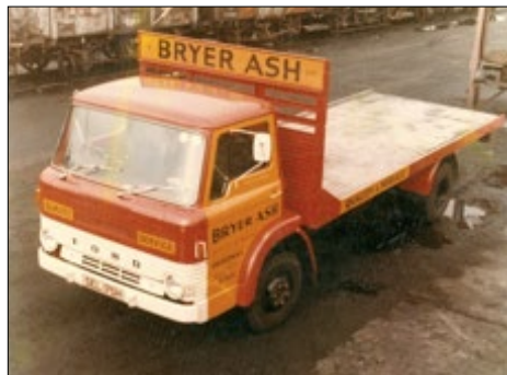
A Bryer Ash coal wagon