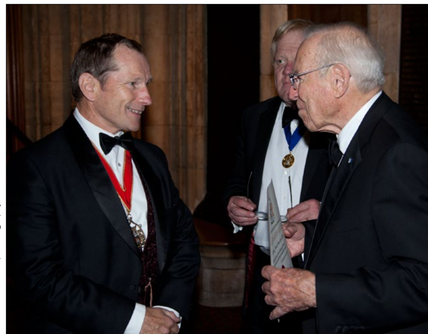
The Master with Jim Lovell at the GAPAN Dinner

traditional Silent Ceremony followed by Presentation of Gifts at which Fuellers gave her the 686 brooch she has worn often. The next day was the incredibly wet Lord Mayor's Show where we had our own float, lunched at Mansion House, watched fireworks and then entertained Fuellers, guests and sponsors overlooking the River and St Paul's at the Globe Theatre.