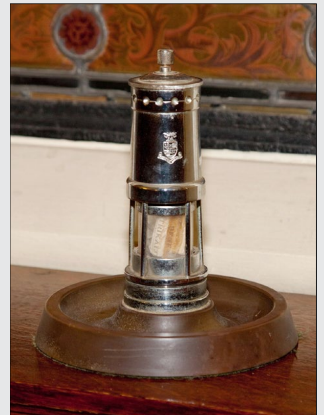
The model Davy Lamp