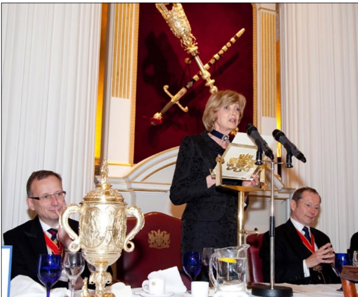
The Rt. Hon. the Lord Mayor's speech