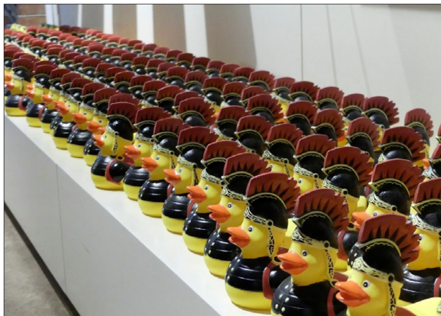
An army of British Museum centurions – the Roman Ducks

With the longest Nave in Great Britain and the seven highly coloured carved statues in the Screen depicting martyrs from different religions, our tour was a great foretaste of what was to come from the rest of the weekend!