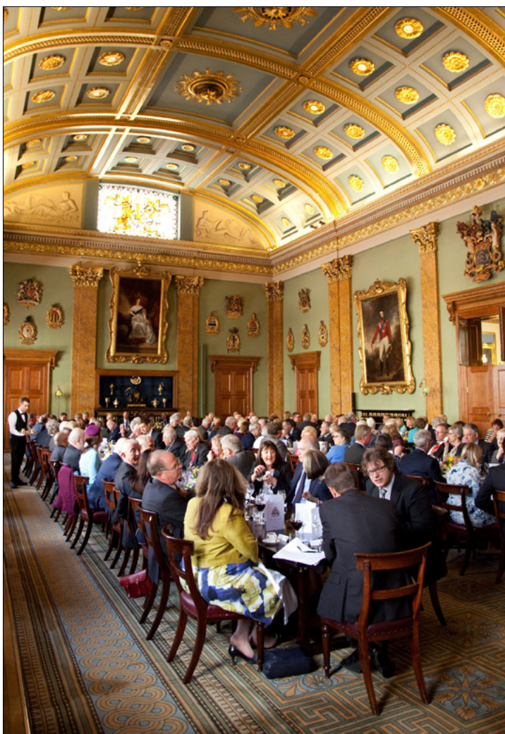
Enjoying the splendour of the Banqueting Hall at Fishmongers' Hall