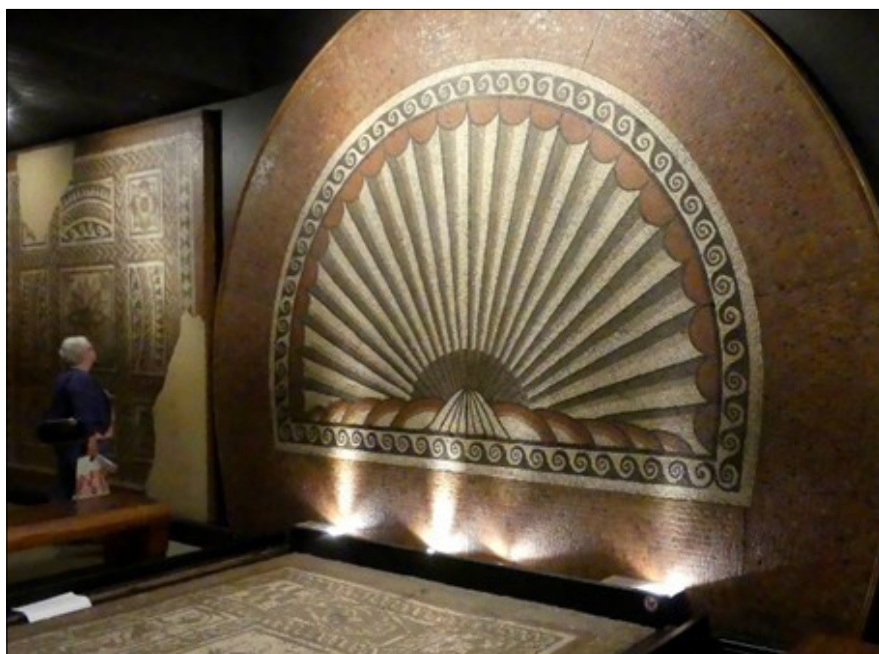
Is that a Shell pecten?