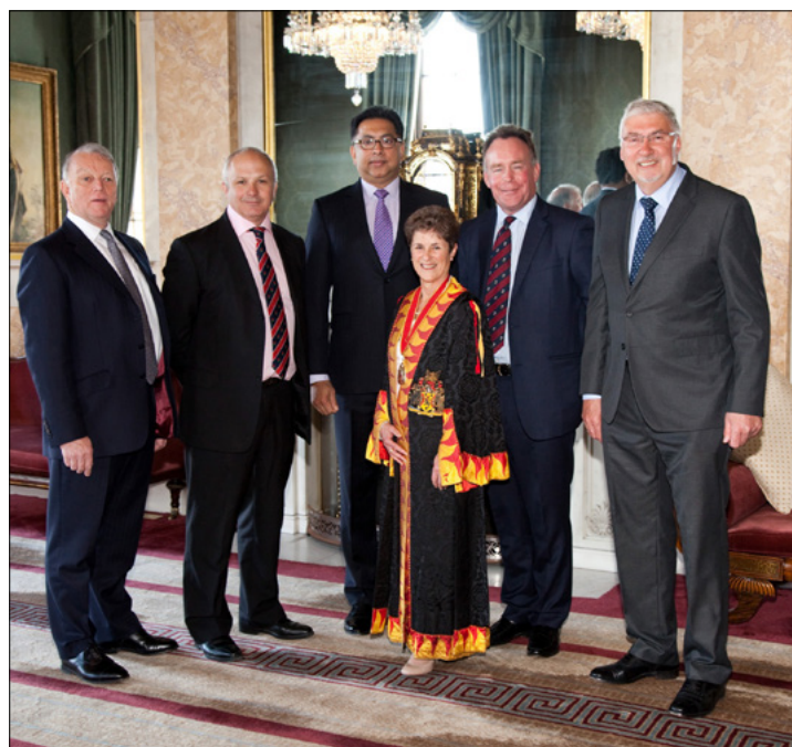
Master with newly admitted Freemen