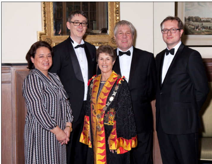
Master with the newly admitted Freemen at the New Year Court