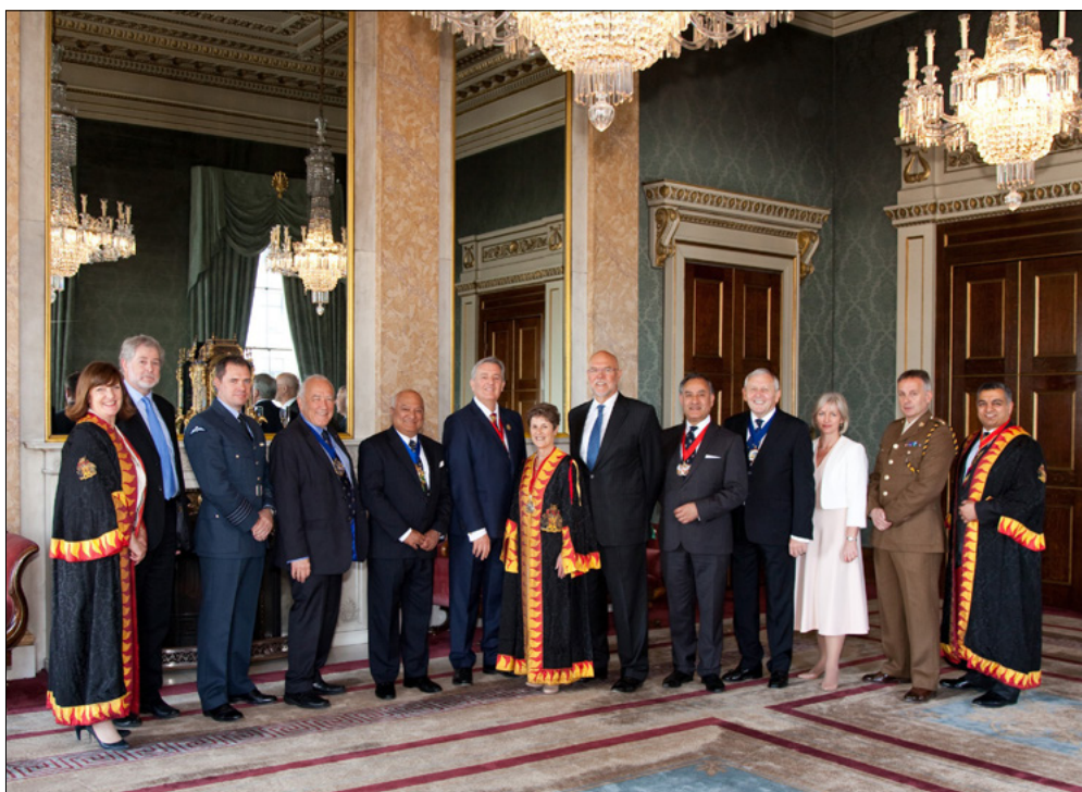
Master and Consort with the Company Wardens and distinguished guests

Immense credit goes to the Masters and their Court Assistants over the intervening years, not just for turning around the traditional company but for redefining its role in the 21st-century and providing a valid and compelling raison d'être . The energy focus of our modern Guild provides an exciting mission for our growing membership and an attractive option for prospective players in this global arena. With the Fuellers Ezra Memorial Lecture, Conversations and many other outreach projects the Fuellers reflects a vibrant presence redolent of the original guilds.