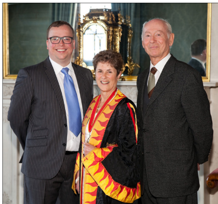
Master with newly enrobed Liverymen