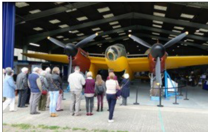
Master's weekend tour of de Havilland Museum

Our tour started in a hangar containing a Tiger Moth biplane and several of its cousins. Originally developed as a general-purpose civilian aircraft before being adapted for training WWII fighter pilots; we heard that after being tested out as a light bomber using hand released bombs – it was rejected because the "bombs" had a habit of ending up back inside the aircraft instead of falling on their target.