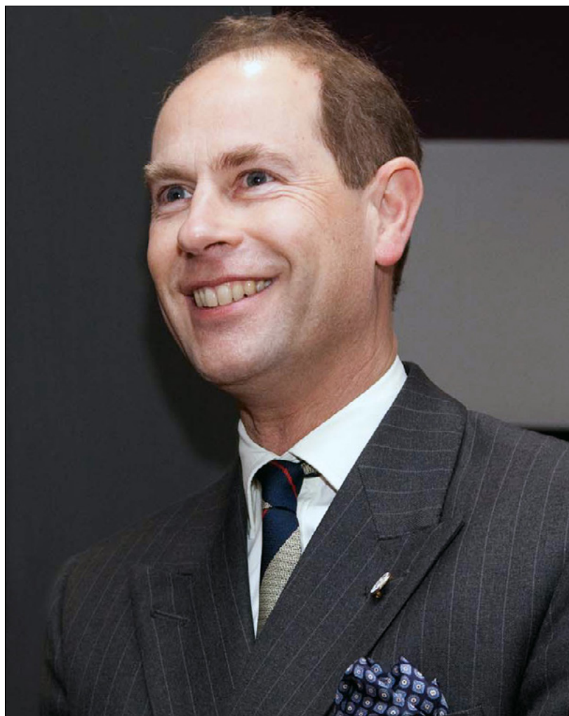
His Royal Highness Prince Edward, Earl of Wessex, KG, GCVO, CD, ADC

Following this we turn our thoughts to 20th September and the Ezra Lecture, our major Energy Industry event, which has Lord Deben as principal guest and main speaker. More about that in due course but put the date in your diary.