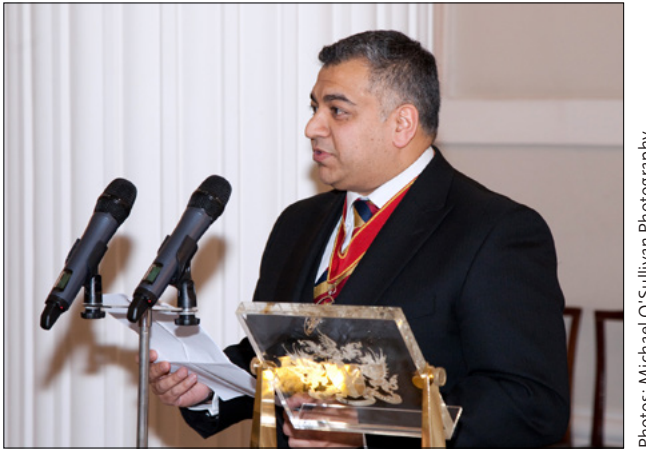
The Senior Warden welcoming the guests