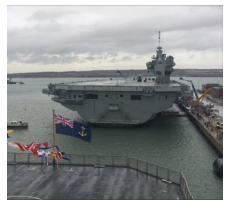
HMS Queen Elizabeth 2

Important elements of the Company Strategy are Industry and Education. I was lucky enough to be invited to the IP Dinner by the Energy Institute, a real chance to engage with the energy industry and re-affirm our commitment to the MOU we have with the Institute. "Conversations" have been scarce for various reasons, but will return and in the meantime, we had an insightful