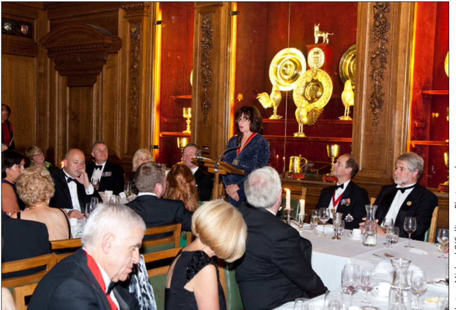
The new Master addressing Fuellers and guests

Loving Cup (three people should be standing at all times!) rounded off the evening as Fuellers and their guests left the tables to mingle in the Outer Hall for a Stirrup Cup before drifting off into the night at the end of an enjoyable evening.