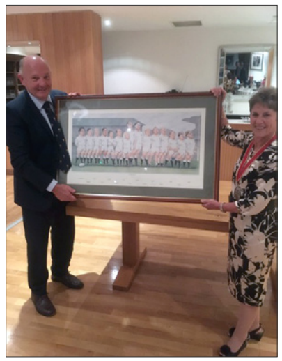
The signed print of the 1991 Lions

Planning for this year's golf day on the 3rd September 2018 is already underway. We are taking the Fuellers Annual Golf Day to the superb Temple Golf Course at Hurley, near Maidenhead The 100-year old club has stunning views of the Thames Valley, and is famous for the American entertainers who have played there. All Fuellers are welcome to take part or just enjoy the lunch afterwards.