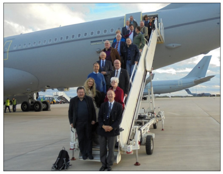
The Fuellers party at Brize Norton

It has been a delight to visit our Military Affiliates. For example, touring the magnificent facilities on RFA Argus, moored at Greenwich; and visiting Brize Norton, 10 Squadron RAF which included an excellent presentation and an air-to-air refuelling flight.