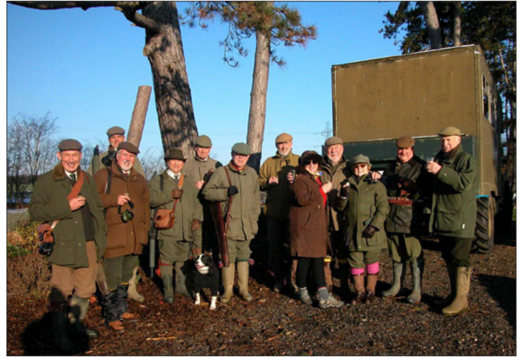
The Fuellers' Game Day

Mansion House in March, when the Lord Mayor entertains all the Masters, is followed the morning after by