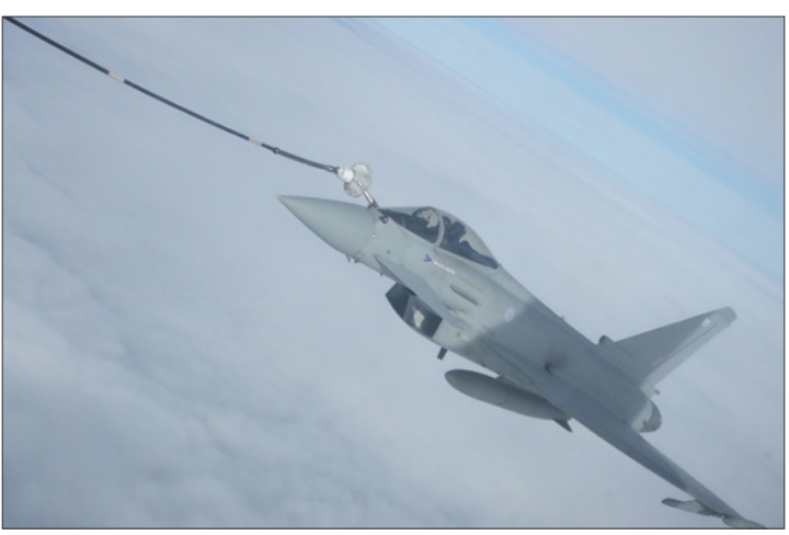
Typhoon being refuelled

There are 14 Voyager Tankers set up under a PFI 28 year contract; 9 Voyagers are solely for Military use, and the other 5 are sub-let to commercial airlines like Thomas Cook and can be quickly brought into service should the need arise. Of the military planes one has no under wing pods for refuelling and carries a civil registration & has no roundels, this is used for the Falkland Islands air bridge. Of the eight other