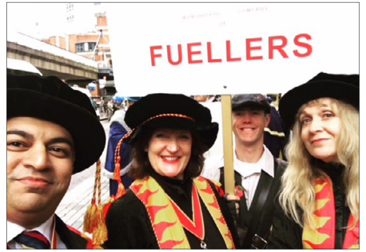
The Lord Mayor's Show

November 22nd was memorable. Starting with breakfast hosted by the Mercers, we learned more about the growing Pan-Livery movement, as it looks to combine the strengths of all Companies as we face common challenges. A quick dash to Westminster Cathedral for the Festival of St Cecilia, lunch with my Wardens then back to the City and Mansion House for the Lord Mayor's briefing. This Mayoralty is working closely with its likely successors, to develop a continuum, and brings change to the Lord Mayor's Appeal as it supports three major charities over a three-year period. Suitably briefed, it was a brisk walk up to Middle Temple for the Actuaries Lecture, a fascinating insight into dodgy data by Sir David Spiegelhalter.