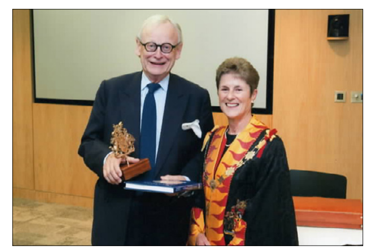
Presenting the Fueller bronze desk crest to Lord Deben

I would like to thank everyone for your donations when I was unjustly incarcerated in the Tower of London on a very hot