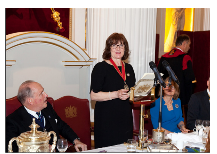
The Master's brilliant speech