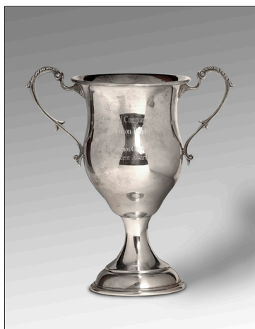
The Harrison Cup

The Sterling Silver Two Handled Cup is by Alexander Clarke, Birmingham 1931. It remains the property of the College and is displayed in a glass cabinet in the College's entrance hall.