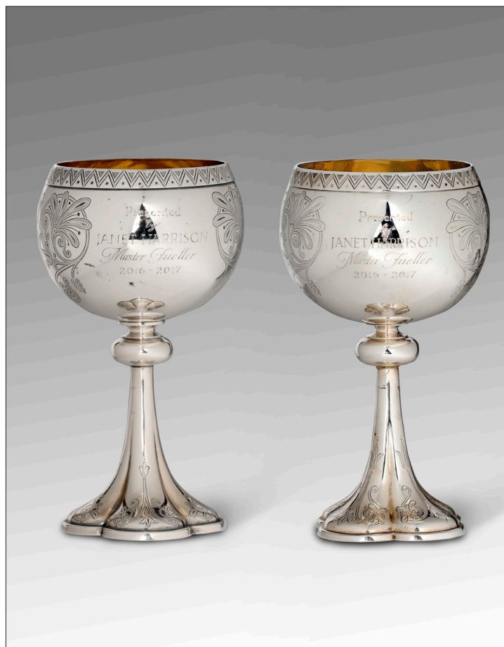
The Senior Warden's and Junior Warden's goblets