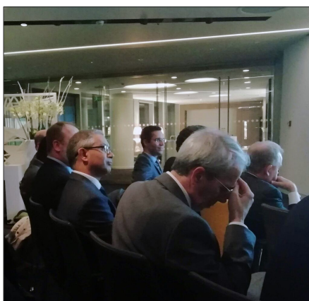
Fuellers and guests

The very nature of the Conversations is to have a debate around the points raised. Significant interest was shown in true