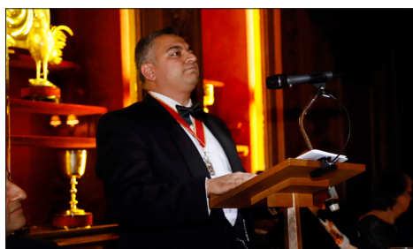
The Master's address