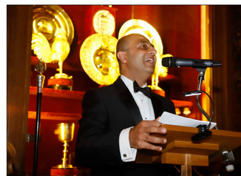
The Speaker for the evening: Lord Gadhia