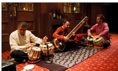
The Sitar and Tabla players