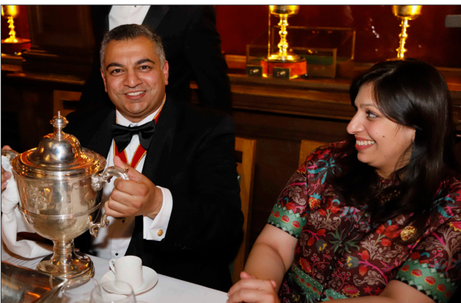
Master and Mistress ready with the Loving Cup