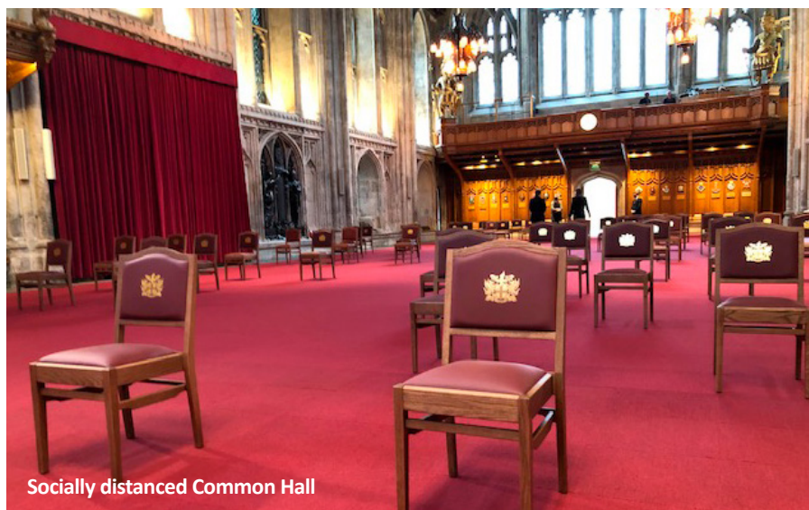
Socially distanced Common Hall

But fear not, all was in hand and Alderman William Russell was confirmed as the Lord Mayor of London for the ensuing year. He said a few words to accept the role and to thank those present and of course the Lady Mayoress for her continued support into the second year. Shortly after, Common Hall was concluded. We duly sat in our seats while the Hall was cleared. As we left by a different exit, all keeping our distance and in file, we were met by a gloriously sunny day in the City. Several little groups went to find their lunch, in groups of six of course, and in no time, the streets were empty again.