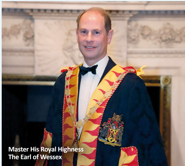
Master His Royal Highness The Earl of Wessex

HRH the Earl of Wessex gave a relaxed speech welcoming those present in 2D. He explained the decision to extend his role as Master and that of the wardens by another year, with the hope of completing his initial aims and to give the incoming master a good start in October 2021.