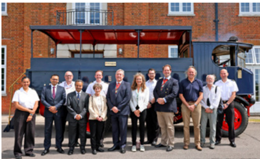
At the HMS Sultan visit in June