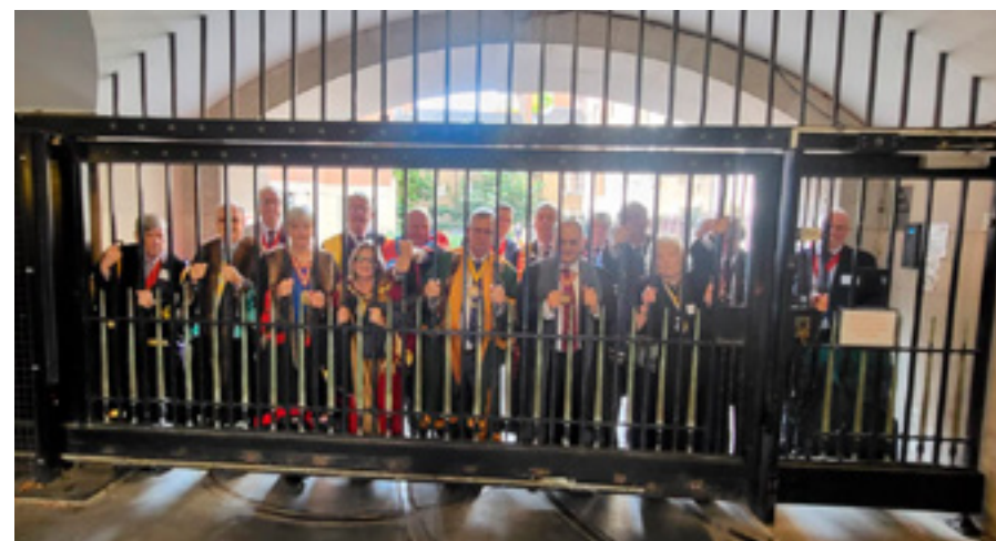
Jailed and Bailed charity event

After the service, lunch was provided followed by an opportunity to tour the ship.