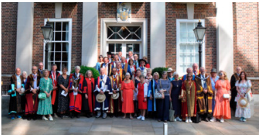
Pan Livery 17th Annual Halls Walk

My fellow Masters and Consorts all met at 8am at Apothecaries Hall where we had breakfast and donned full robes, hats, and badges for the eight and a half-mile walk around the City Livery Halls. We started fresh and keen visiting forty Livery Halls with a group photograph taken outside each Hall. The weather was dry but very hot, with all participants taking on water where we could. The walk concluded at 5pm with a hot and relatively bedraggled group enjoying a well-earned drink at Southwark Cathedral.