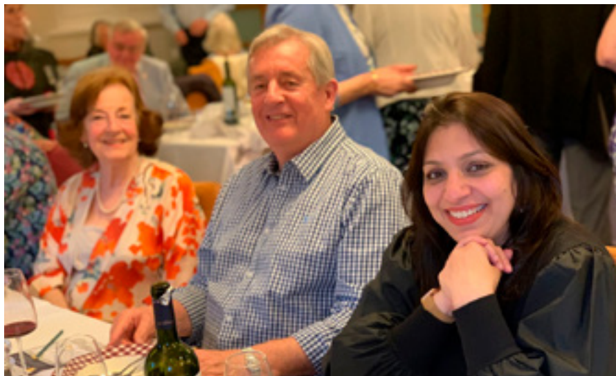
Master at the Pudding Club