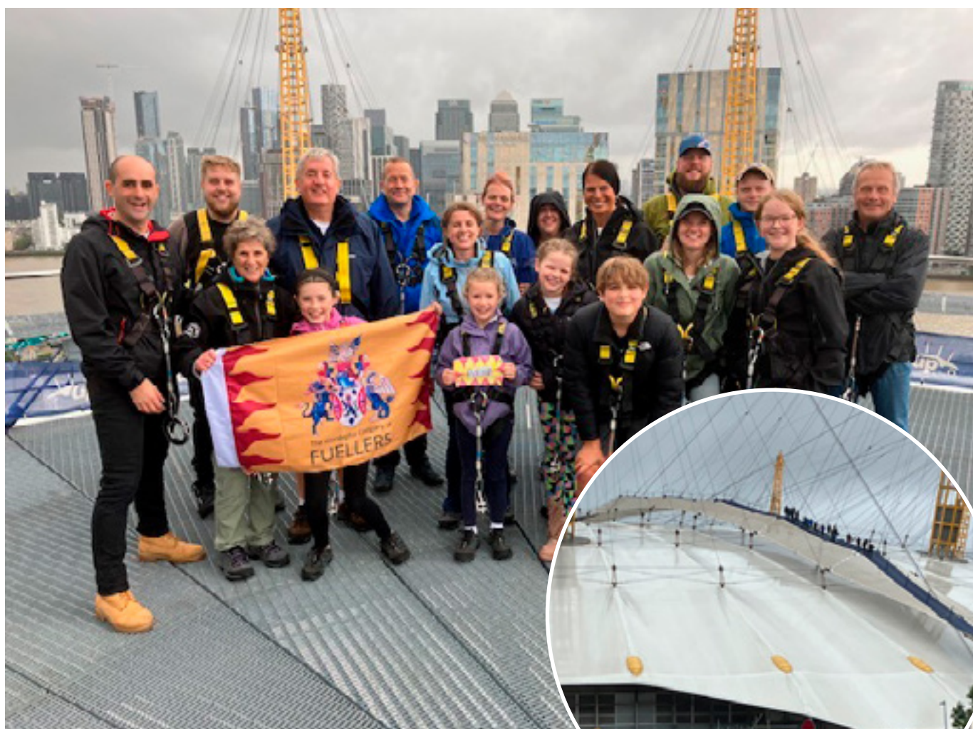
Above: Master O2 Walk

The Master would like to thank all those who supported him and donated. The donated funds are to benefit the Fuellers Charitable Trust, the RNLI and The British Heart Foundation.