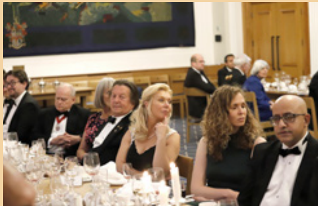
Attendees enjoy the speeches