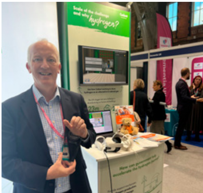
The Hydrogen Zone that Cadent was part of won Best Stand at the Conservative Party Conference

As such, we agree with the Prime Minister when he says that we need to transition to net zero in a proportionate and pragmatic way that does not unnecessarily give people more hassle and more costs in their lives. This will be vital if we are to maintain public support for the transition.