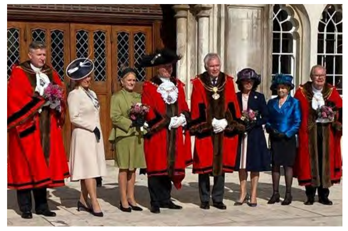
(I-r): Fuellers process to St Olave's Church for the Annual Thanksgiving Service; Election of Lord Mayor.