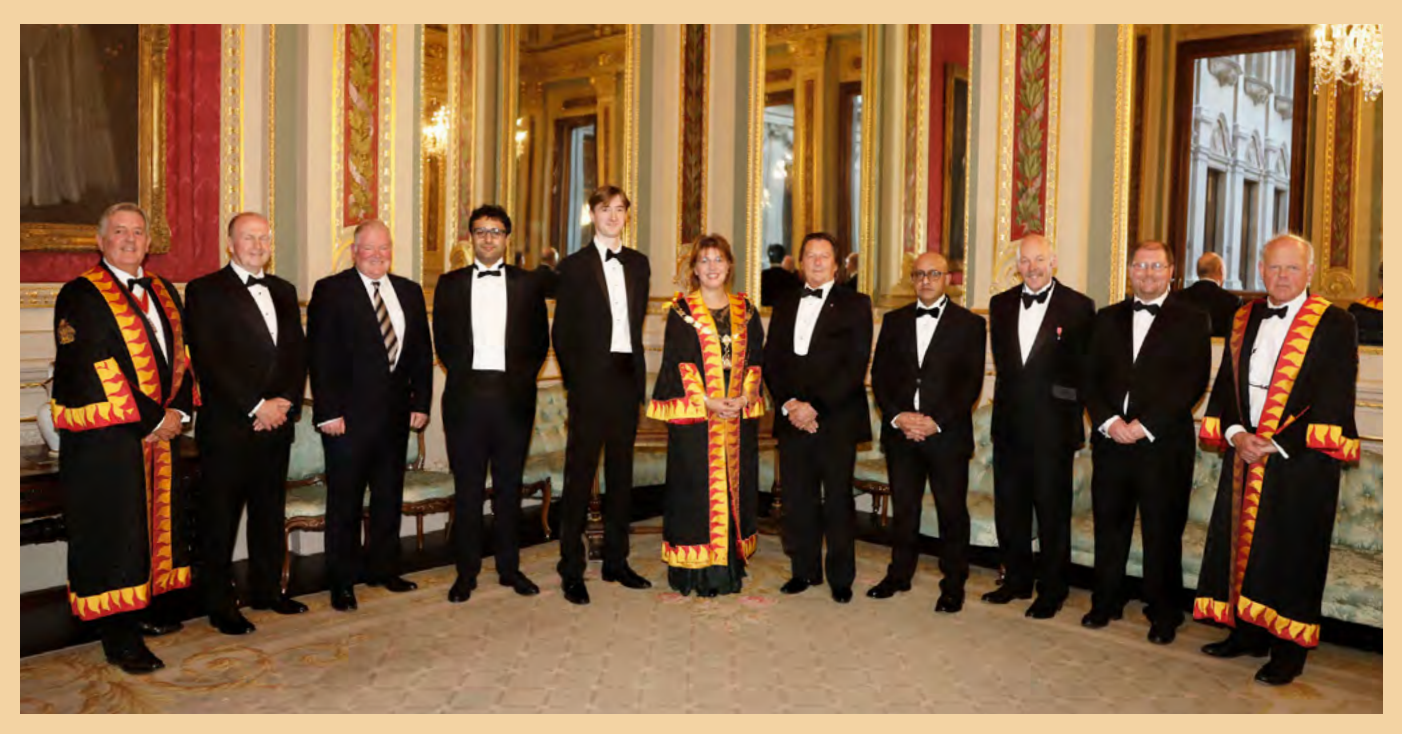
New Liverymen and Freemen with the Officers.

n a rather amusing note, she told her audience of her trusty silk flowers which accompanied her to each Court luncheon and dinner during her year in office, always positioned in pride of place at the top table! We hope they continue to flourish in pastures new!